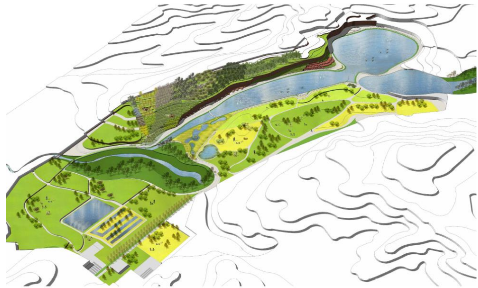
Figure 3: A POSSIBLE SCENARIO FOR THE ANGLESEA OPEN CUT.

The text has subsequently affected a variety of disciplines and ideas including environmental impact assessment, new community development, coastal zone management, brownfields restoration, zoo design, river corridor planning, and ideas about sustainability and regenerative design.