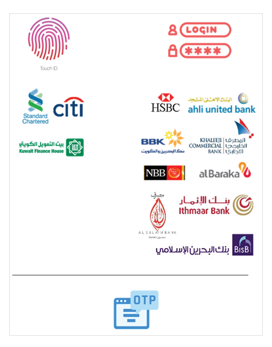
Figure 1: Authentications of Banks of Bahrain Mobile Application.