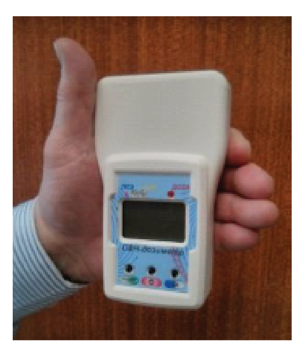
Figure 3: The photo of the microwave dosimeter.