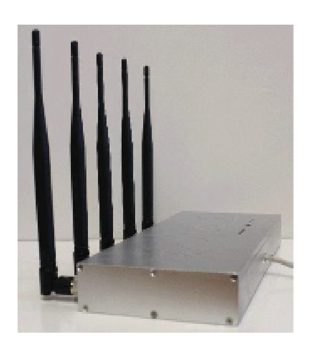
Figure 2: Photo of the microwave imitator (generator).

the small intervals between the discharges of neurons. After satisfying the animals with corresponding needs, the interval pattern of the electrical activity of brain nerve cells was reorganized from group to regular single type with the dominance of one interval on histograms. In our experiments, we used a modulating signal corresponding to the initial motivational and emotional state in defensive behavior.