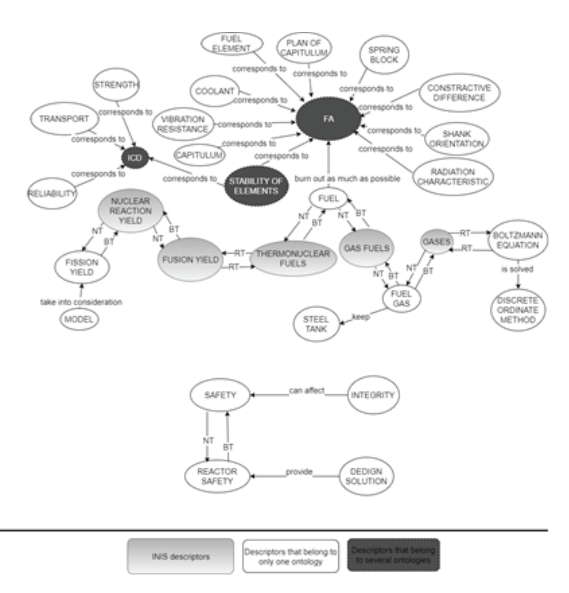
Figure 2: A fragment of the resulting graph combining ontologies.

The calculations of the connectivity components of multigraphs for the five ontologies showed the following values: 'Layout of the main equipment' – 62, 'Strength and seismic stability' – 25, 'Intracorporeal devices' – 81, 'Technical solutions for the modernization of the reactor plant' – 41, 'Sources of radiation' – 19. As a result of the union operation, a multigraph consisting of 186 connectivity components was formed at the functional level. After applying the thesaurus, the number of connectivity components was reduced to 170. Thus, using a common conceptual basis made it possible to increase the semantic similarity of the result.