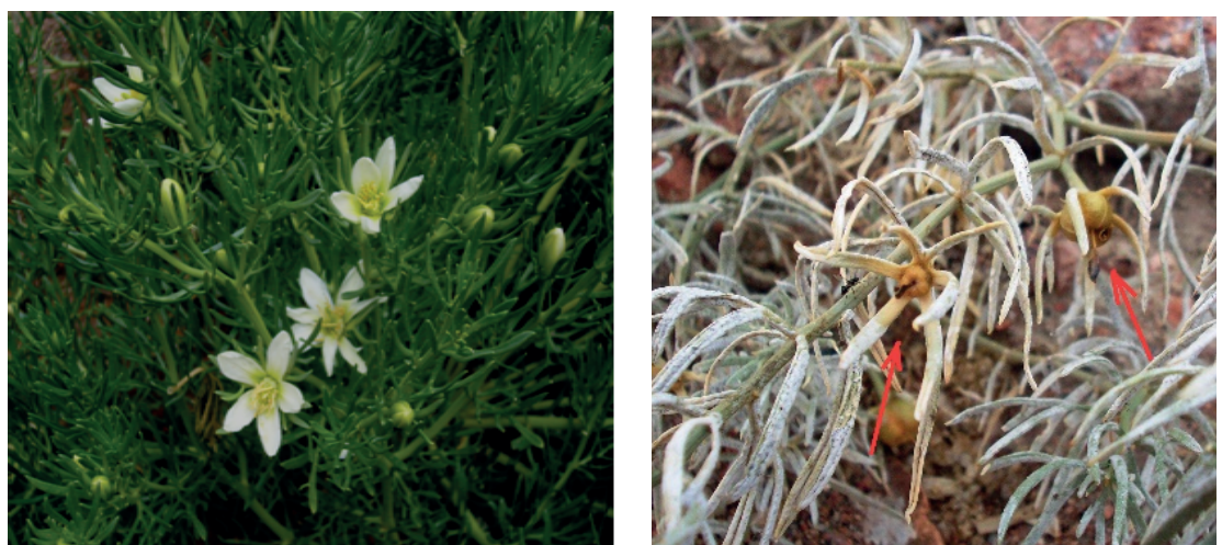
Figure 3: In place of flowers Peganum harmala , 5 petals marked 6.7 petals, the sterility of flowers Peganum harmala .