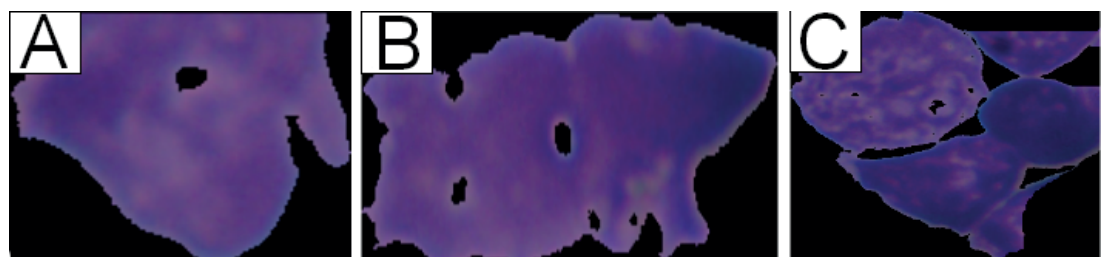
Figure 3: Examples of different types of artifacts: (a) an first type artifact, b) an the second type artifact, c) third type artifact.

Each nucleus of cell from 1018 cells images was assigned to one of the types. 82% of nucleus were allocated correctly. Were reviewed and categorized the artifacts of