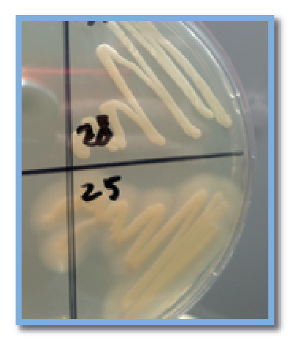
Figure 3: Determination of staphylococcus lecithinase activity.