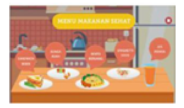
Figure 4: Main Menu Display.