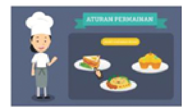
Figure 3: Game Rules Display.