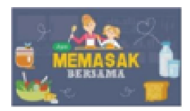
Figure 1: Opening Display.