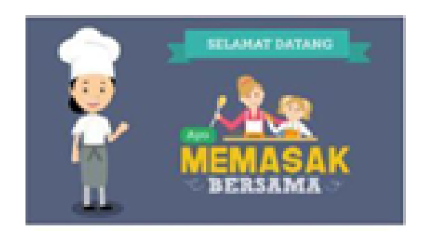
Figure 2: Welcoming Display.